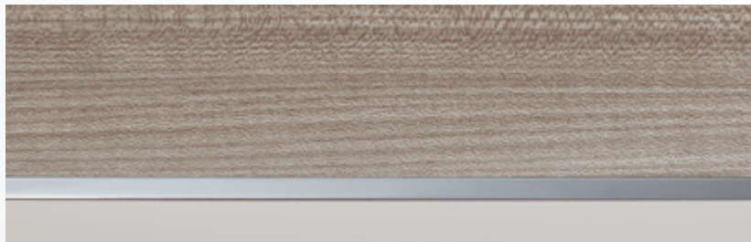
MIAMI MODERN CABINETRY